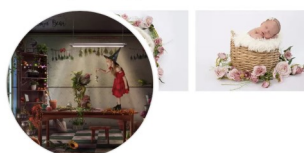
Brown Bear Photography - Newborn & Cake Smash

BROWN BEAR PHOTOGRAPHY Capturing your Precious Memories